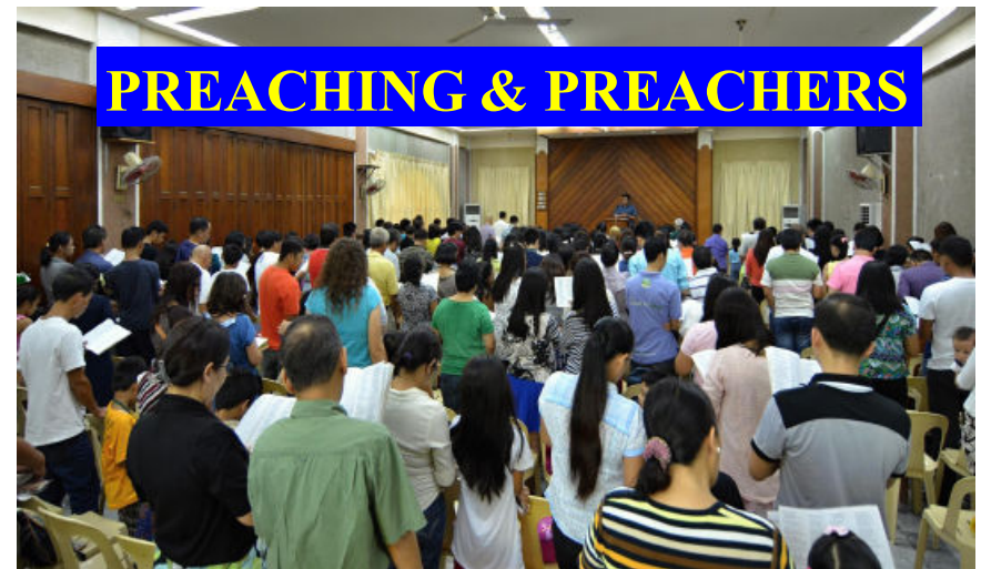
A Lord's Day morning worship service at CRBC